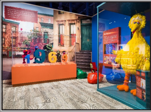
The Center's Worlds of Puppetry Museum is a mecca for all fans of Sesame Street, The Muppets, and other television shows and films featuring Jim Henson's puppets.

Museum: The Center's Worlds of Puppetry Museum houses two permanent exhibition galleries and temporary rotating special exhibition gallery. The Jim Henson Collection Gallery, showcases one of the most comprehensive collections of Henson's objects from Henson's life and work, taking visitors through a chronological journey of the body of work of one of the most prolific puppetry-focused artists in American History. The Global Collection Gallery, arranged geographically, sheds light on the global significance of puppetry in education, entertainment, politics, and religion by exploring the universal elements and themes of the art form. The Center also curates temporary special exhibitions, such as Christmas Town: The Story of Rudolph the Red-Nosed Reindeer , where patrons learn about the history of this iconic holiday character through early licensed objects such as a first edition of the Montgomery Ward illustrated publication and two remaining stop motion puppets from the 1964 Rankin/Bass Rudolph the Red-Nosed Reindeer television special.