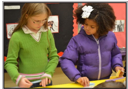
Children learn how to build and manipulate their very own puppets in the Center's Create-A-Puppet Workshop™

Center's in-person services—such as workshops, classroom visits, artist-in-residence experiences—into paid virtual services that could be offered to school groups and families alike. By coupling these offerings with the time-tested programming of the Digital Learning Department, the Center is able to provide a variety of virtual offerings to the local patrons and classrooms that would normally physically access the Center's educational, entertaining, and inspiring programming. This ingenuity led Atlanta Magazine to include the Center for Puppetry Arts in its Best of 2020 List as the "Best Home Edutainment" option.