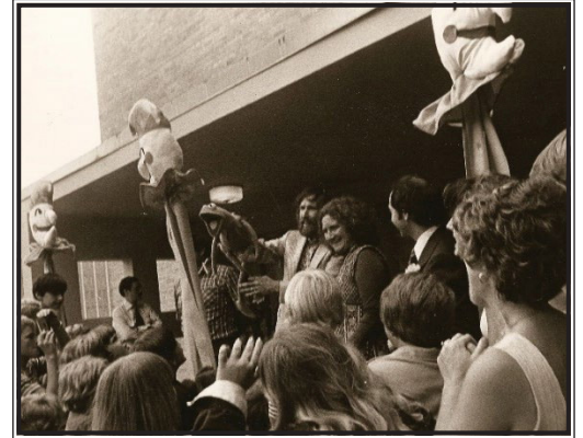
Jim Henson with Kermit the Frog at the Center's opening in 1978.

For over forty years, the Center has introduced millions of visitors of all ages to the wonder and artistry of puppetry through three key programming areas: performance, museum, and education. These program areas work in tandem to showcase puppetry in action, as a fine art, and as a gateway to imagination.