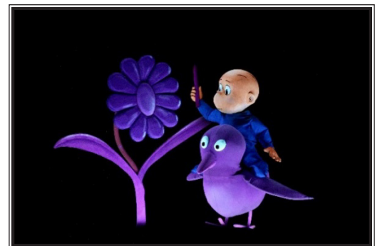
A scene from the Center's premiere production of Harold and the Purple Crayon.

The Center has a long history of producing high-quality work, and the Center's performance program has received numerous awards, including 13 Citations of Excellence from UNIMA-USA (the American branch of the international puppetry organization), the Spirit of Suzi Award from the Suzi Bass Awards (Atlanta's Annual Theater Awards) in 2011, Kennesaw State University's Flourish Award for Outstanding Arts Organization in 2012, a Governor's Award for Arts and Humanities in 2013, a Children's Theater Foundation of America Medallion Award in 2019, and eight Suzi Bass Awards, including one for the 2019 production of Harold and the Purple Crayon .