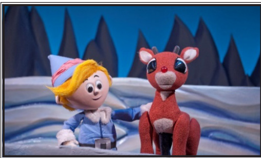
Puppets from the Center's production of Rudolph the Red-Nosed Reindeer™

Performance: The Center's Performance program annually produces and presents more than 600 fully-staged live puppetry performances through the Center's Family Series and New Directions Series for Adults and Teens. Both series include original performances written or adapted by the Center and created in-house by Center staff and/or by talented craftspeople and composers from the metro Atlanta area. These productions are performed by the Center Company, with all singing and speaking parts performed live. The Center also presents noteworthy guest artists from around the nation and the world each year, which not only enriches Atlanta's artistic landscape with diverse talent and points of view, but it also provides opportunities for local artists to learn from and be inspired by other performers.